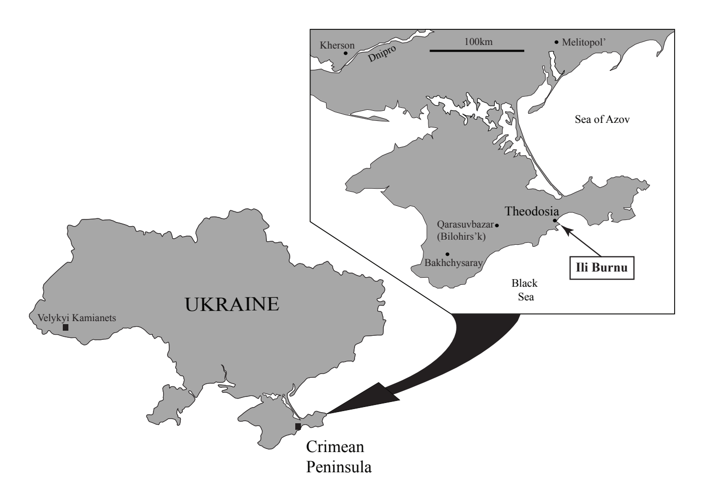
Fig. 1. Locality map of sites mentioned in the text.

In 2018, our team published an account of the uppermost Jurassic to lowest Cretaceous rocks of eastern Crimea - that crop out in the cliffs at the eastern extremity of the hill mass of Tepe Oba, around the headland of Ili Burnu. That publication was then commented upon by Arkadiev et al. (2019). We are at something of disadvantage in discussing local lithostratigraphy in reply, because whereas we have tried to present carefully measured representations of the accessible stratigraphic sections at Theodosia (Bakhmutov et al. 2018, figs. 2 and 3), Arkadiev et al. (e.g. 2019, fig. 2; and earlier papers by the same authors, cited herein) promote synthetic and composite diagrams. It is not possible to compare measured logs of tangible rock sequences, an accurate lithostratigraphy, with stylised diagrams and estimated thicknesses. Earlier, Bakhmutov et al. (2018) referred to problems encountered when trying to make comparisons with published Russian accounts, where it was apparent that the thicknesses given were less than accurate.